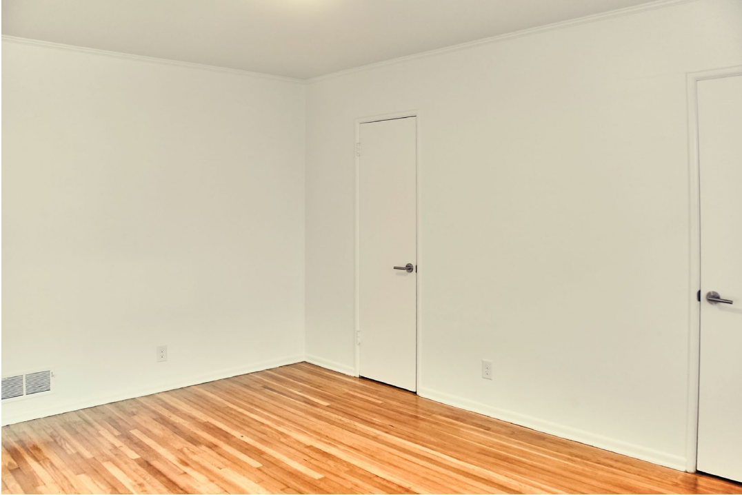
3 rd Bedroom