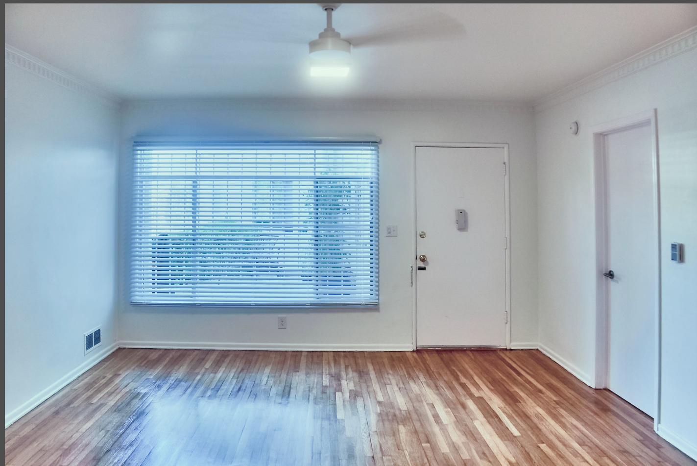
Living Room Reverse