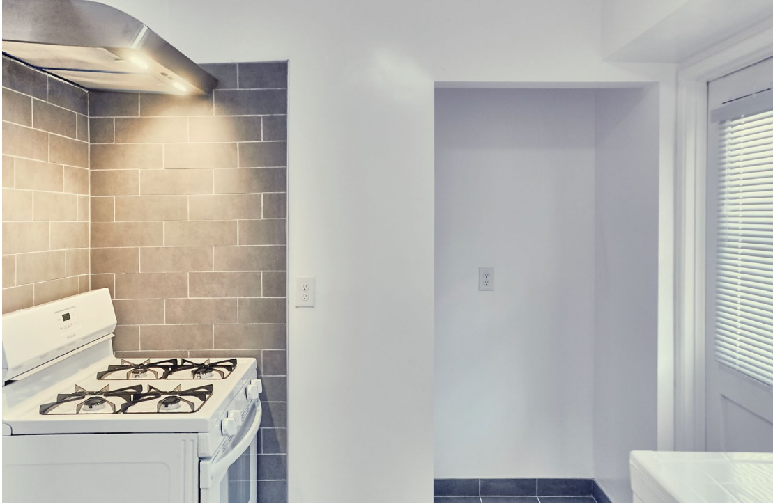
Kitchen – Fridge Included but not pictured