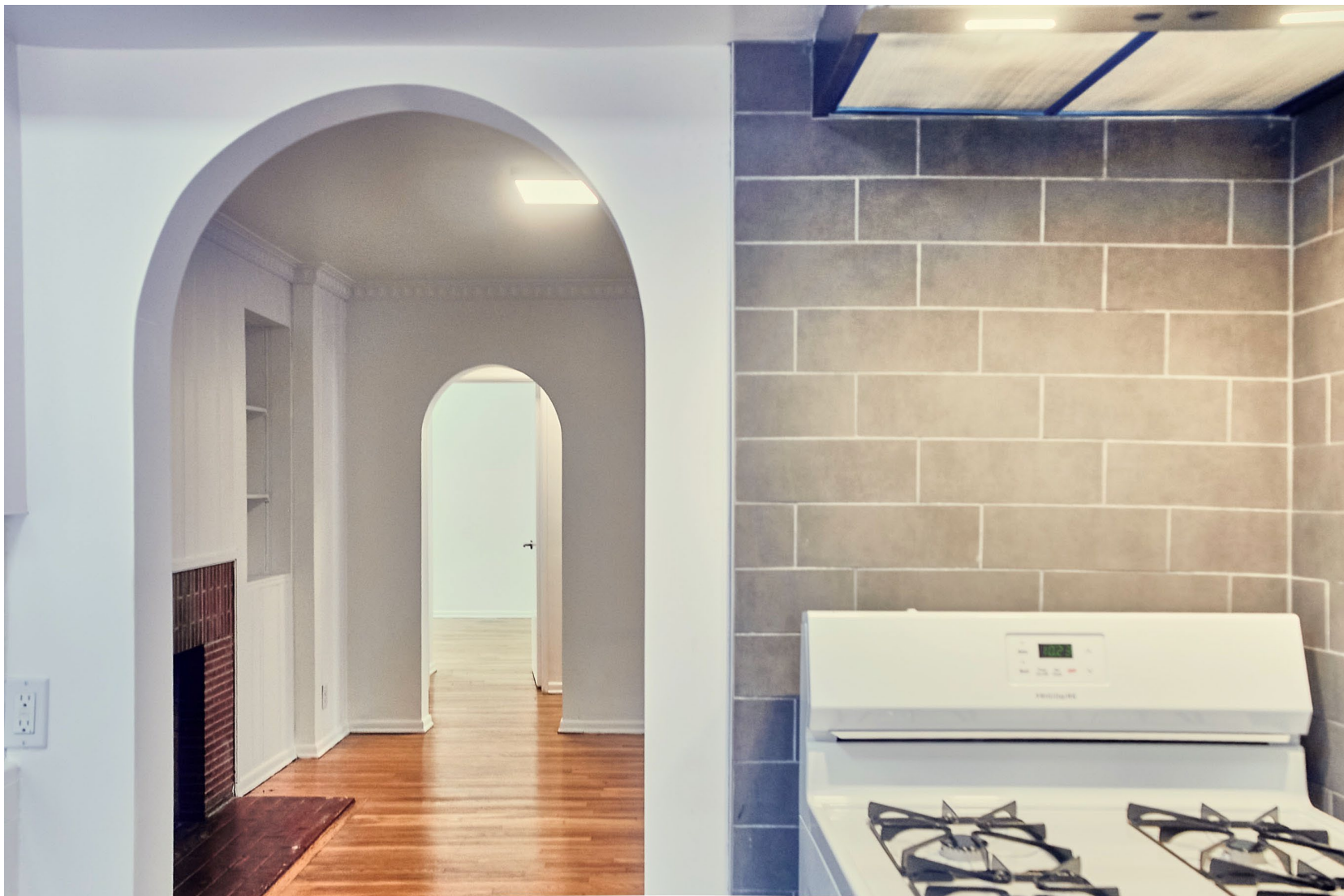
View to Living Room