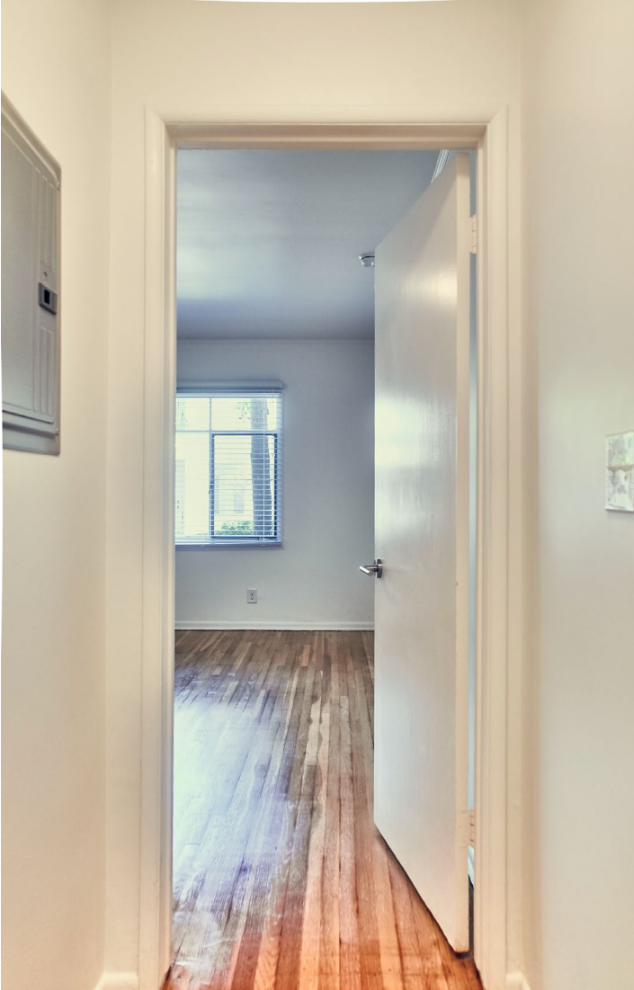
To 3 rd Bedroom