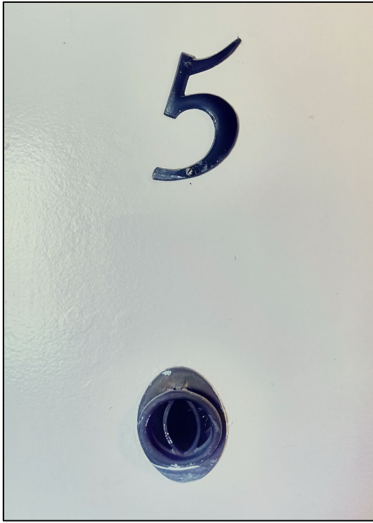
700 Levering Ave – Unit 5