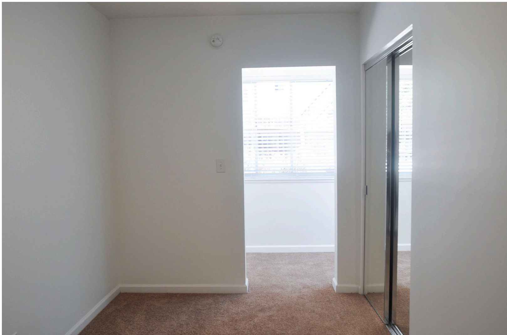
Bedroom 1 – View to Attached Study