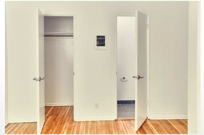
Second Bedroom, doors to closet and half bath