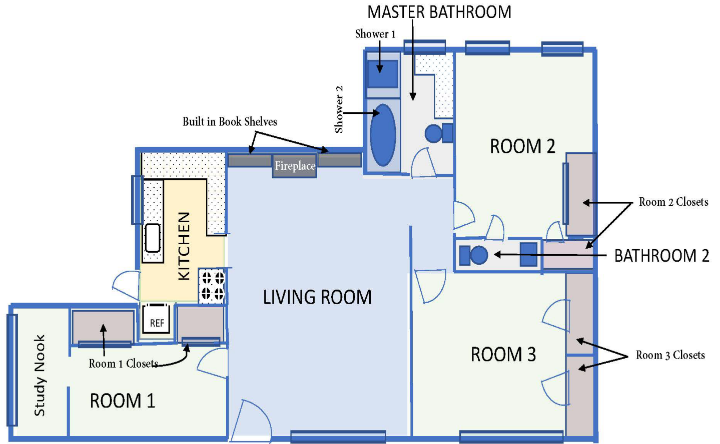
MODEL D UNIT LAYOUT

*Minor variations may occur between Model D Units