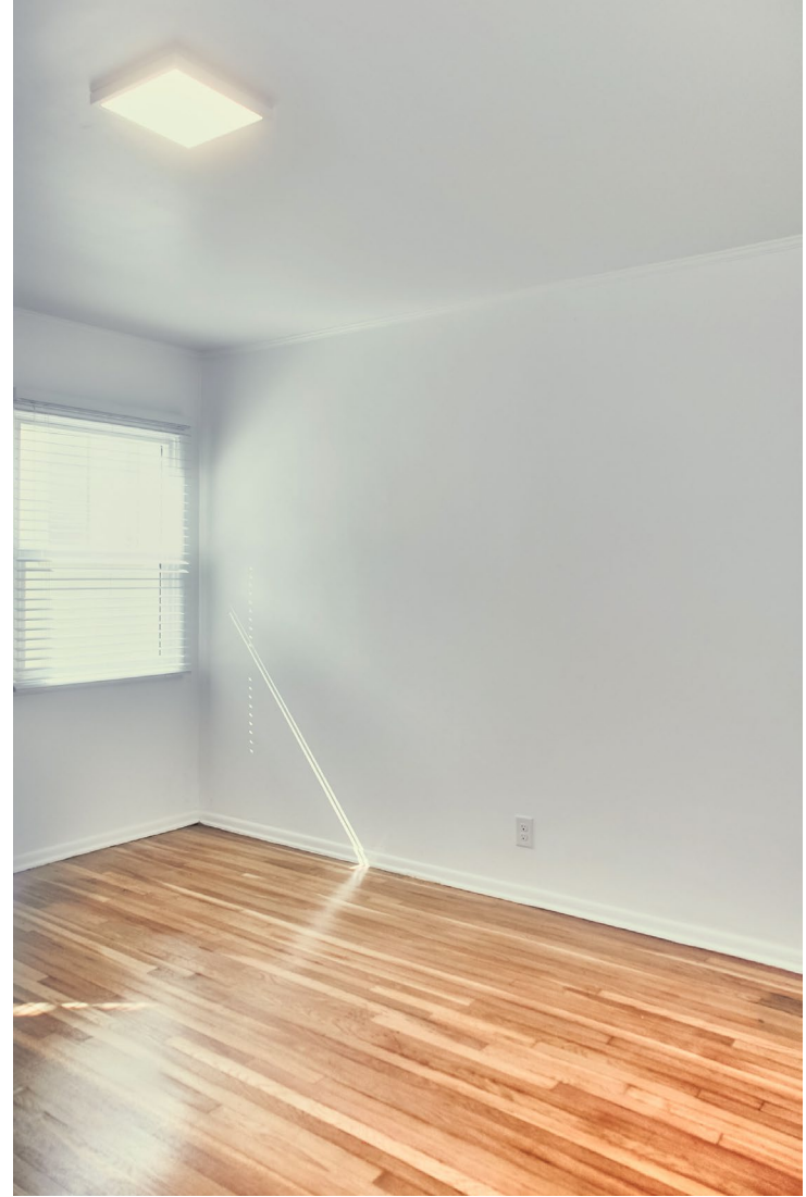
3 rd Bedroom