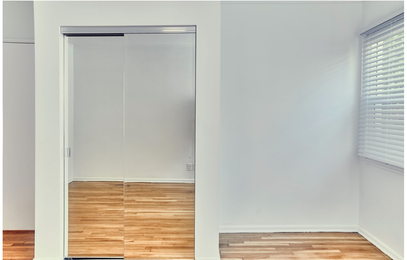
Bedroom 2 – Bedroom has half bath in the Room