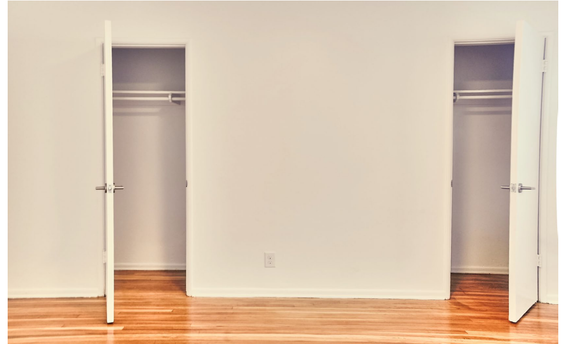
Bedroom 3 - Closets